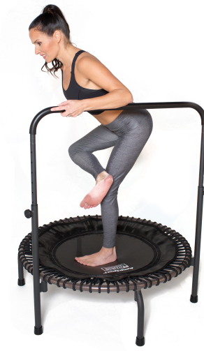
FIGURE FOUR STRETCH